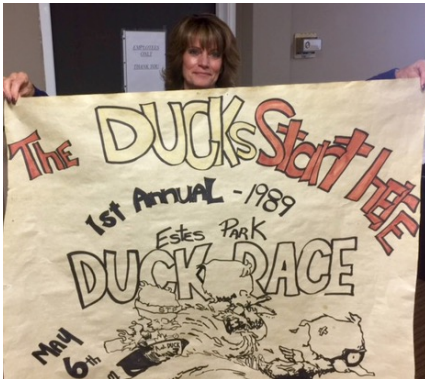
The first Duck Race poster will soon be in the Estes Park Museum.