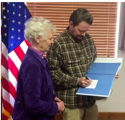
A book for the library to thank the library employees.