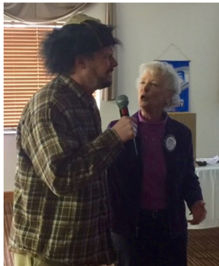
In character for the Cents for Colorado program.