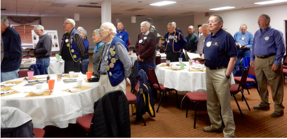
A melodious group!