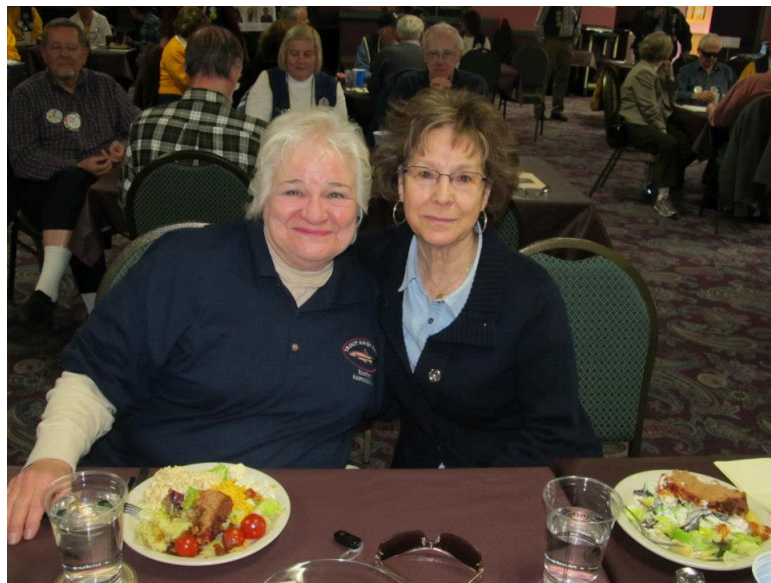
Our Guests from the Sunrise Rotary