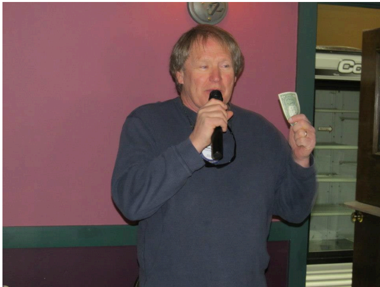
Ward is ready to close the deal