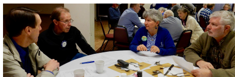
Rotarians at work!