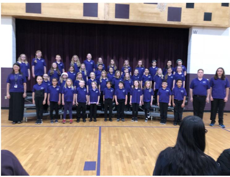
Mountain Echoes Choir

Recently, Mountain Echoes had the honor of singing The National Anthem at a Colorado Rockies game this past May.