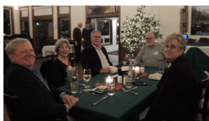
Rotarians and their guests