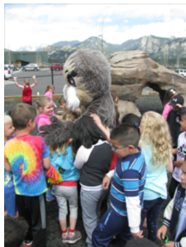
Josh visits EP Elementary in 2018