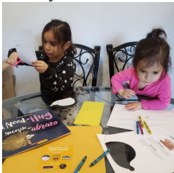
Children Enjoying Kits