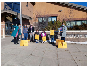
Families with Activity Kits

Many families sent notes of appreciation and enthusiasm to EVICS about the project, and have expressed the hope that it can continue in the 2022-2023 school year.