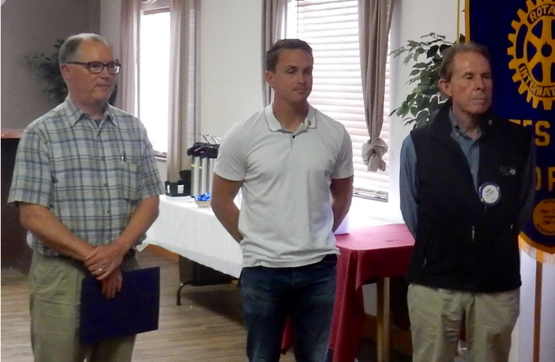
Three newly-inducted Paul Harris Fellows. Congratulations, former presidents!