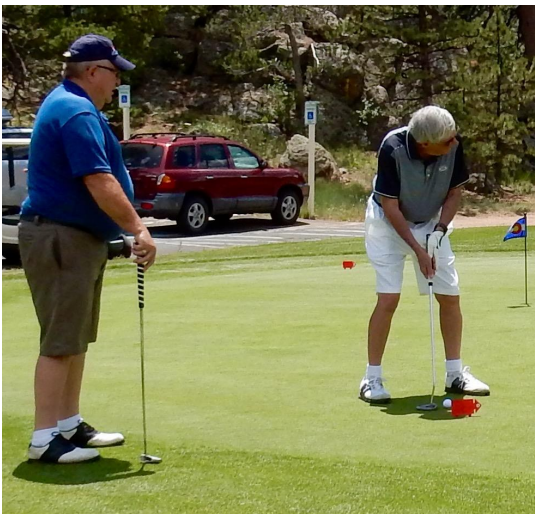
Registration is underway for the annual golf tournament.