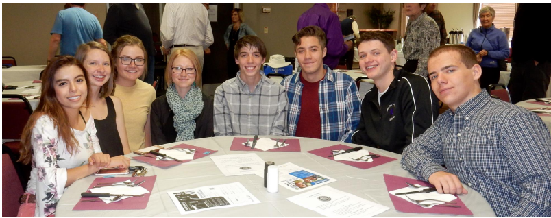
Our scholarship recipients met the club and told us of their college plans.