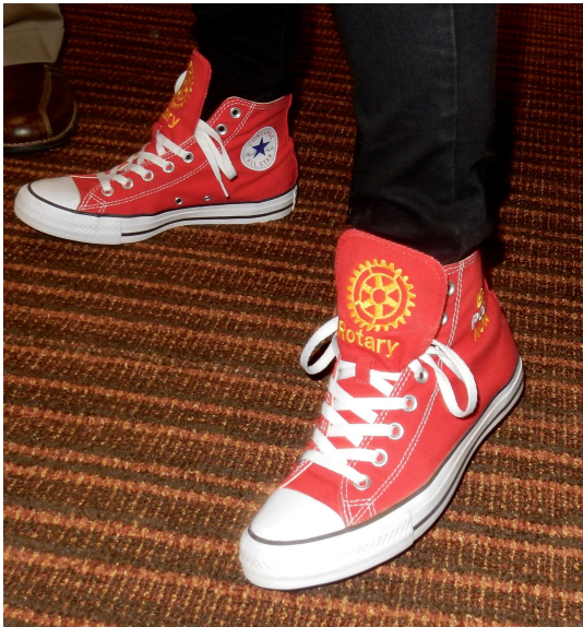
Shoes fit for an international conference.