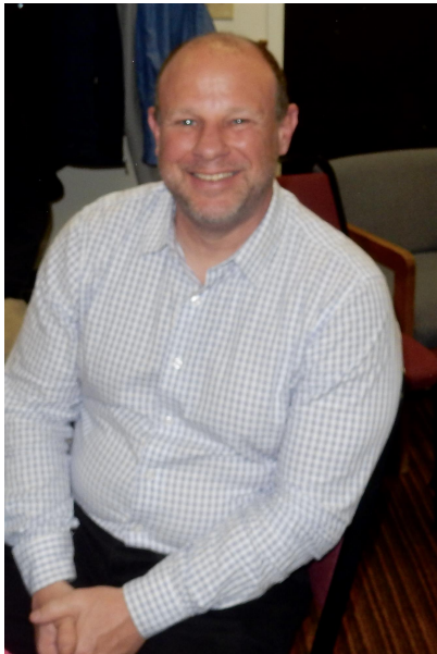
Sunrise visitor and proud Dad of a scholarship recipient.