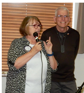
Please pay your dues!