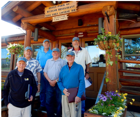
Just a few of the many club members working to make this year's golf tournament the best ever.

Download your registration forms from our website. Turn it in to any member of the golf committee (pictured below).