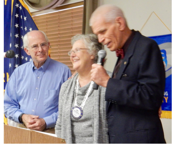
This newsletter editor/public relations volunteer was indeed surprised. Her husband now has to keep the beautiful vase filled with flowers.