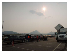
Early Morning at 2021 Shred