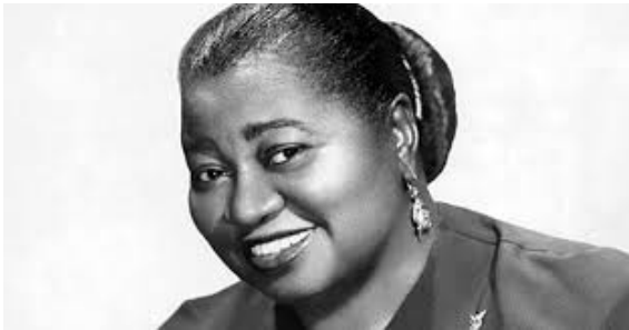
Actress Hattie McDaniel

In 1940, Denver-raised Hattie McDaniel became the first actor of color to be nominated for and to win an Academy Award for Best Supporting Actress for her groundbreaking role as co-star of "Gone With the Wind".