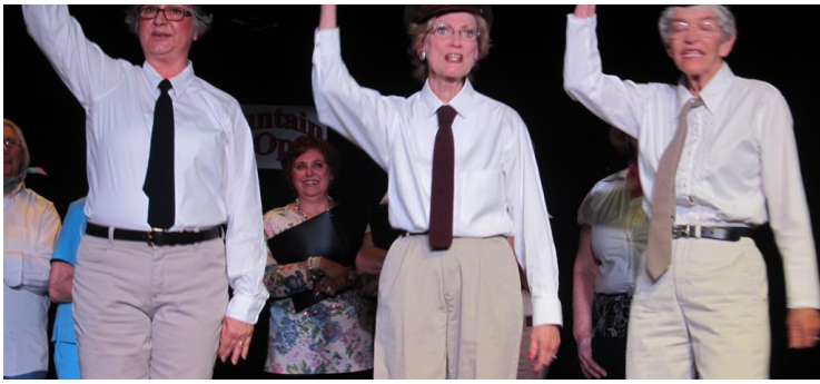
The Ladies from Company G