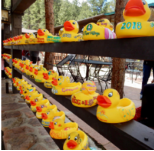
Come and celebrate our Duck Race sponsors!