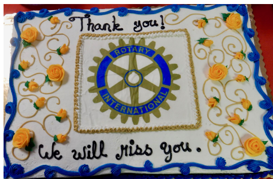
So long , farewell to Rodeway Inn staff!

The meeting was adjourned with the 4-Way test.