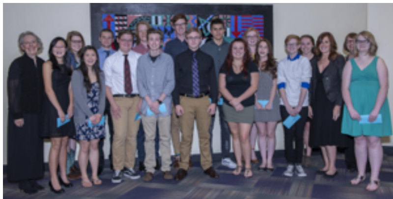
2018 Rotary Club of Estes Park scholarship recipients