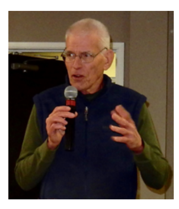
Thor happily added to a modest tip he received from a student at The Pumpkin Giveaway, enriching the Happy Money collection.