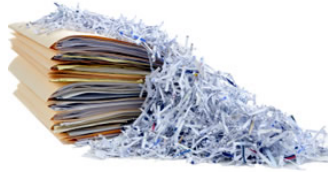
Secure shredding - a community service