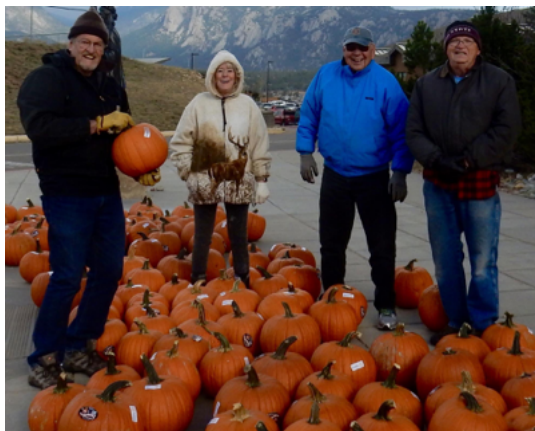
Some of our club pumpkin helpers

Joined by members of the high school Interact Club, our own Rotary volunteers unloaded 560 large pumpkins Friday morning at Estes Park Elementary School. Then the fun began, as hundreds of students in grades K-5 chose their very own pumpkin and either rolled or carried them into the school. Choruses of Thank You's made club members smile.