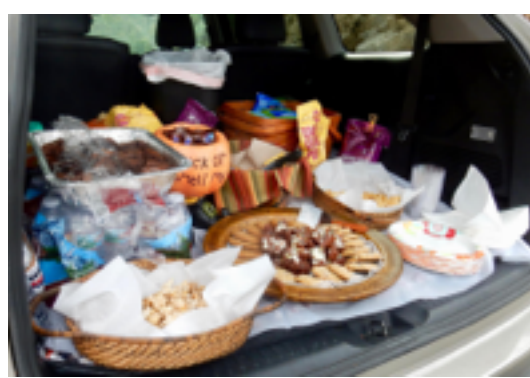
The Rotary Club of Estes Park Works!