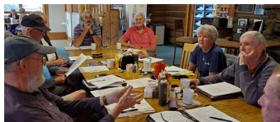
Your Golf Committee hard at work