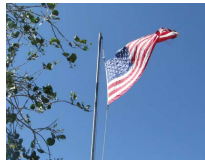
Old Glory on a beautiful day