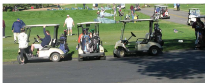
Golfers Ready to Play