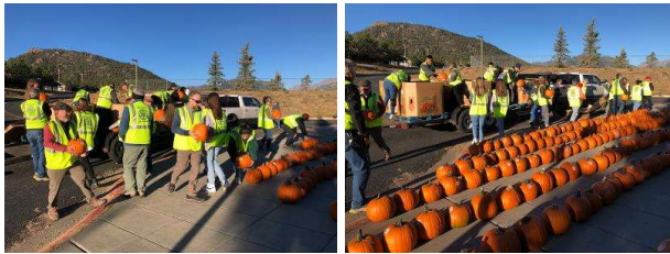
Rotarians and High School Interact Students Getting the Pumpkins Ready!