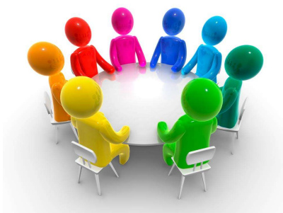
Table Topics & Community Service Committee Meeting