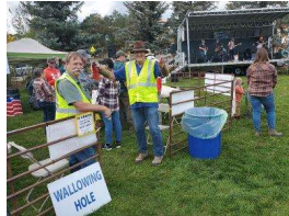
Keeping Us Legal