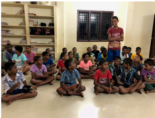
Some young residents of Angel Home