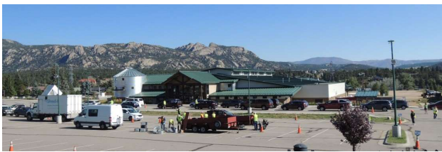
August 27, 2022 Shred-A-Thon

Great volunteers, good weather, a great community service, and a nice take of $2,537 for 3 hours of work. Tara