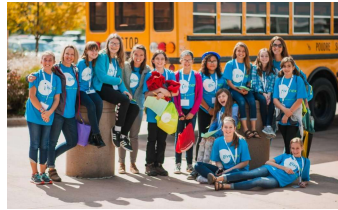
Youth in Give Next Program

Our program this week will be held in person, but a Zoom link will be provided. Click on the link below to be admitted. Meeting link: https://us02web.zoom.us/j/7985707369