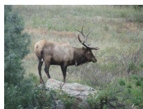
Master of the 17th. Hole

This was the 25th year. For each of the past five events, Estes Park Seniors received between $30,000 and $44,000 in Rotary Club Scholarships for continuing education at vocational schools, community colleges, and four-year universities. Thanks to the participants and generous sponsors (businesses and individuals) Scholarships are POSITIVE evidence of community support for advanced education.