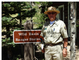
A Rotarian celebrating a milestone of 50 years with Rotary shares his story.

I am a 3 rd generation Rotarian from Ellinwood, Kansas. We spend the summer at our home 10 miles south of Estes Park on the east side of highway 7. I have volunteered at RMNP for the past 8 seasons as a trail ranger in Wild Basin, as an interpretative ranger at Lily Lake and the last few seasons as a patrol ranger up to Rainbow Curve. This is my second year as a docent at the Stanley Home & Museum. I received an MS in Education College Level Counseling. My first job was at DePauw Univ. in Indiana.