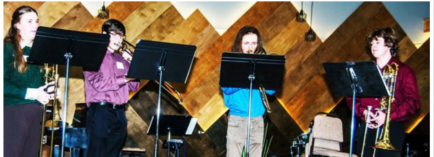
The festive atmosphere of our annual Holiday Celebration was enhanced by a talented group of CSU students - a trombone quartet - playing holiday music favorites during our luncheon.