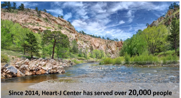
Since 2014, Heart-J Center has served over 20,000 people