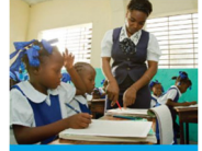
BASIC EDUCATION AND LITERACY