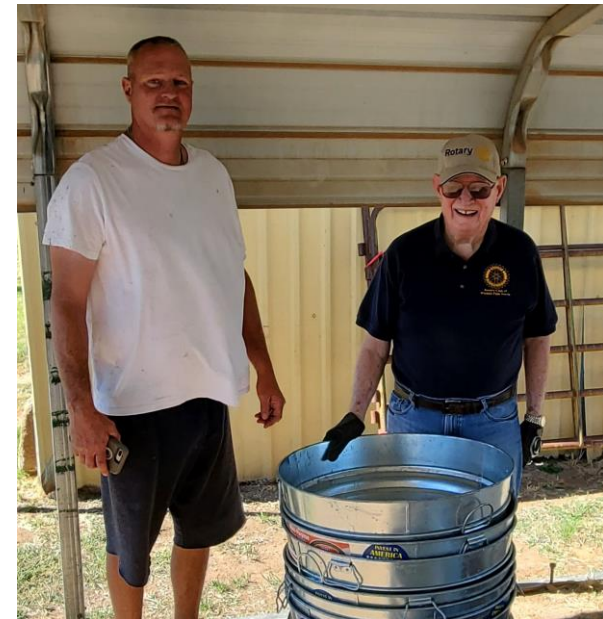
OUR CLUB'S DONATION OF WASH TUBS TO WHISPERS OF HOPE HORSE FARM.