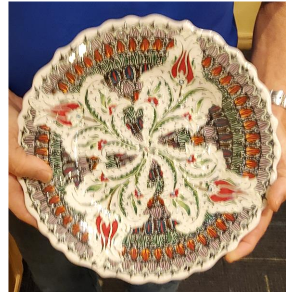
This plate glows in the dark!