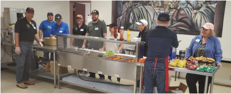
The serving line at our service project to Faith Mission.