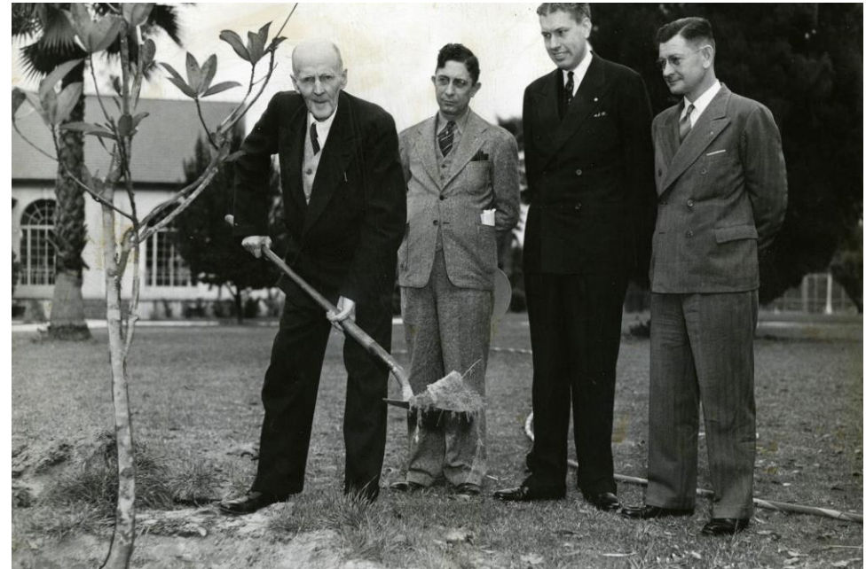
PAUL HARRIS PLANTS A FRIENDSHIP TREE IN LAKELAND, FLORIDA, USA, IN 1942.