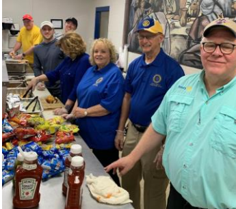
This picture is from where the club cooked and served lunch to Faith Mission.