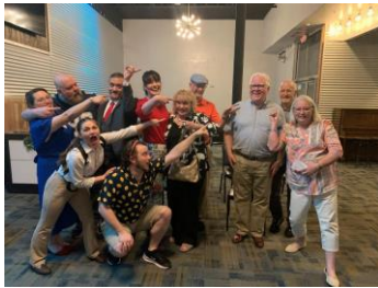
Everyone, including the cast, decided that Clint was the killer!