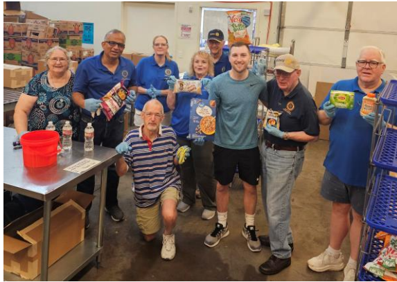
Saturday's Service Project at the W.F. Area Food Bank.