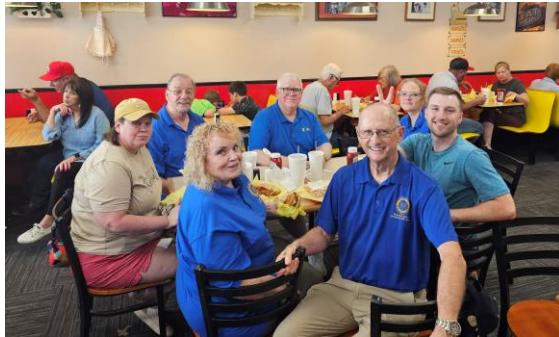
Lunch at Ronnie's Burgers after the food bank project.