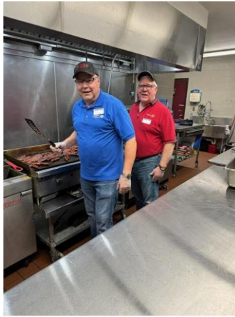
The below pictures are from the Scotland Park Elementary School's Perfect Attendance Party. Rotary North donated 25 pizza's.