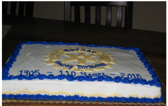
On February 23, 1905, Rotary was founded by Paul Harris in Chicago. Since that date 110 years ago, Rotary has grown to over 1.2 million members in 34,000 clubs around the globe.

The program has 8 -15 recovering members at any time. They meet every Sunday night at 6:30 PM at the Graham Street Church of Christ.