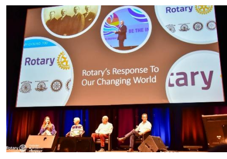
Q & A session