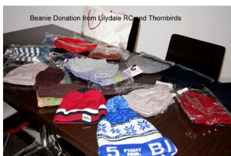
Beanie Donation from Lilydale RC and Thornbirds