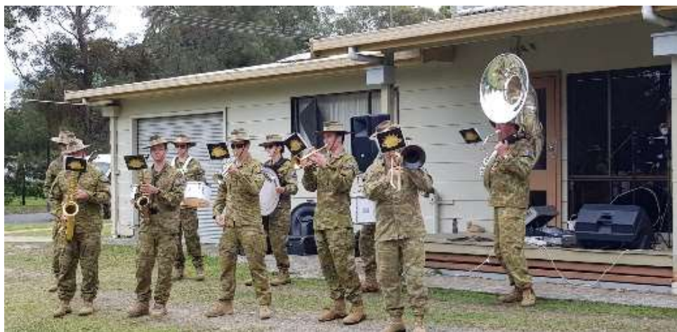
(BELOW) The Australian Army Band of Melbourne were in fine musical form

With the hay and stock feed side of things, we have been donated approximately 200+ bales of hay from a property in Colac with EGRFA only needing to pay for the cartage to East Gippsland. Jim Cahill has been doing a tremendous amount of work to make this happen around the current issues of movement restrictions.