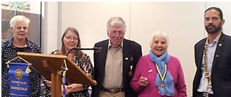
Rotary Club of Bairnsdale - 2020/21 Leadership Team

With an 82 year old Club comes a history and many traditions, I look forward to the responsibility of upholding these values