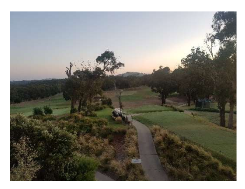
(LEFT) View of the Golf Course from dining room (BELOW) Grand Ballroom Dinner on Saturday Night

One takeaway I have is all clubs and most districts are aware of RC Bairnsdale's efforts with Farmers Relief and more recently with the Fire Aid. For the first time at these events, everyone knew where Bairnsdale was! All were curious as to how we are going 'way over there'.