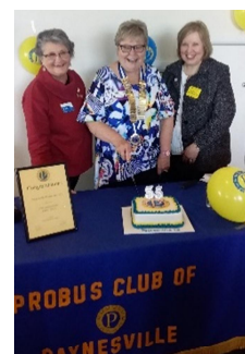
Probus Club of Paynesville members