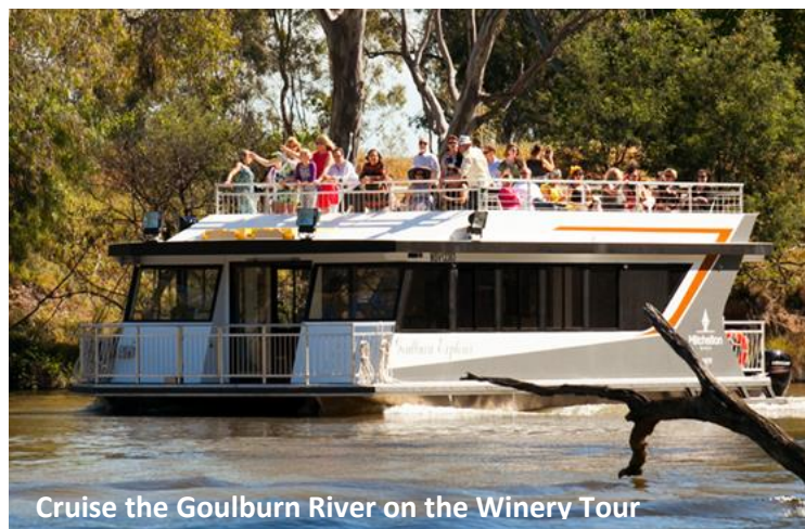
Cruise the Goulburn River on the Winery Tour