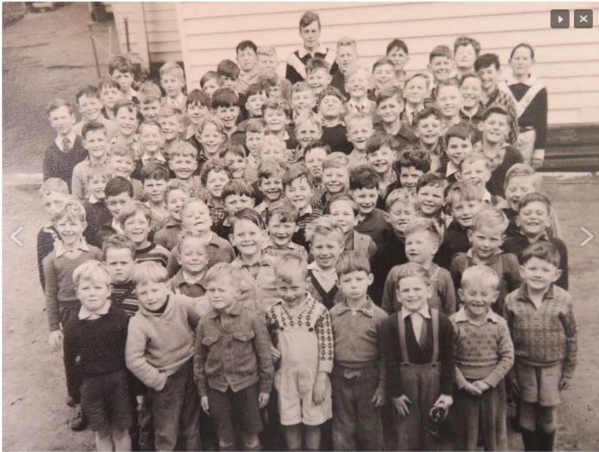
The-boys-of-Longwarry-School-1956 Item 37 of 62

The Boys Of Longwarry School 1956