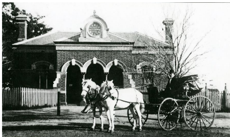
Drouin Opened in June 1890 the foyer below the triple arches was later enclosed and had a glass façade. This building was part of a public buildings precinct with the Police Station and residence alongside.

Legible Handwritten content can also be submitted.