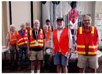
Big Blokes BBQ