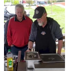
It's my turn!