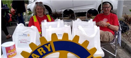
Market Ambassadors – First Shift