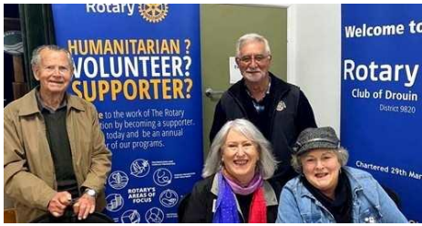
At the Drouin Hub