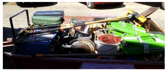
Kevin's trailer fully loaded