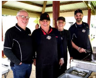
Shift 1 at Market