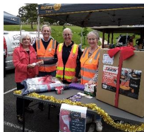
Raffle ticket sellers