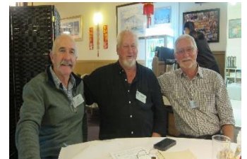
Nice to welcome 'guests'