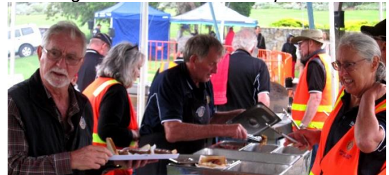
Was that with onion? Did you want a sausage too?