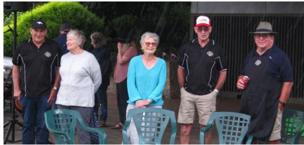
Waiting in the wings for room at the barbeque