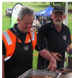
B1 and B2