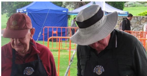
Heads down watching those eggs