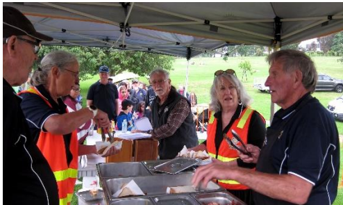
What do you mean "Tofu burger?"