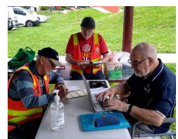
Managing the Market