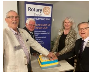
Senior Rotarians cut cake