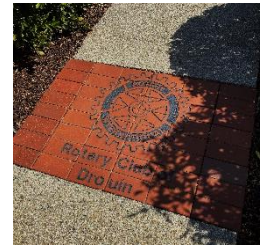
at Centenary House