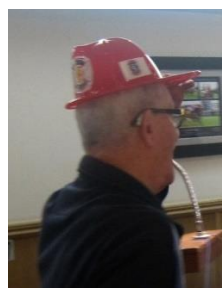
Coming or Going DvL?